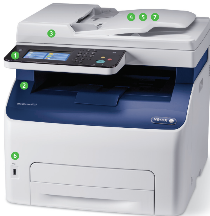
WorkCentre 6027. Copy. Print. Scan. Fax. Email.